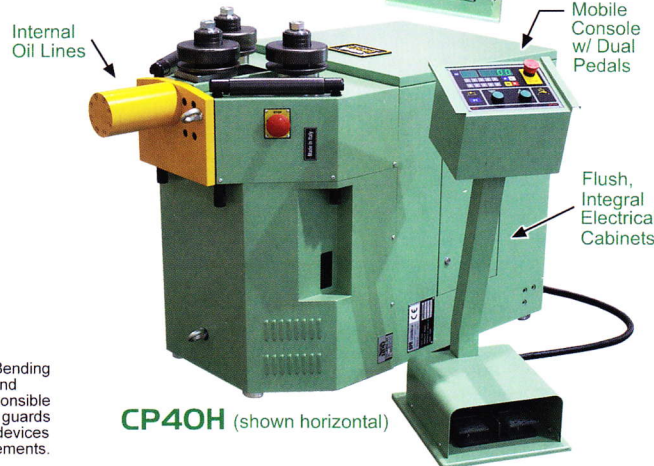
CP40H (shown horizontal)