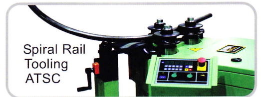
Spiral Rail Tooling ATSC